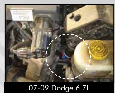
07-09 Dodge 6.7L